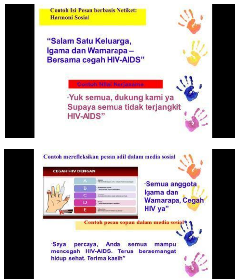
Picture 3 and 4. Examples of Campaign Messages

The initial assistance carried out by the team was by introducing campaign messages which can be used by field officer on their HIV/AIDS prevention socialization.