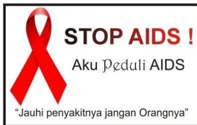
Picture 5 and 6. Power point slide presentation of BBM and WhatsApp status

While the message on Facebook can be picture and link of an article related to campaign on a particular place in order to inspire field officer's Facebook readers. This can also be used as broadcast message to field officer's BBM and WhatsApp contacts.