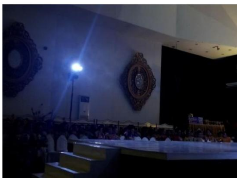
Picture 8 and 9. 26th Anniversary of IGAMA Celebration at Kartika Graha Hotel, Malang