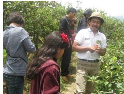
Member KTMA services the tourists

In business, customer service must come first. No matter how small the wishes and complaints of customers must be considered. So that cooperation can continue and manufacturers will get regular customers.