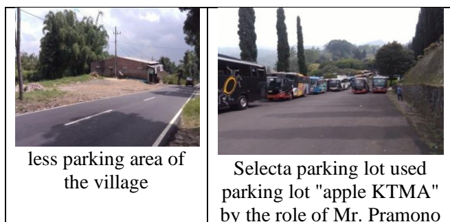
Photos 8. Parking of apple picking tours

The problem solving faced by KTMA is greatly helped by the presence of such informal figure. Likewise motivating members when a visit is down. Conditions like the above without the presence of an important figure can be sure to meet a steep road.