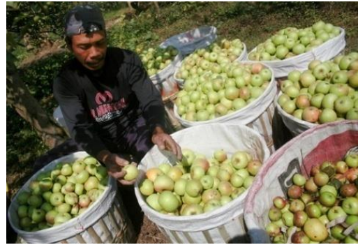
KTMA member harvest results