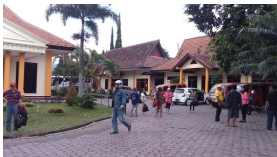
Village transport / mikrolet (batu-selecta) ready to transport tourists

The form of cooperation as mentioned above enables the creation of technological improvement scheme (dynamic case institutional change). The innovation of cooperation as institutional change theory, that the change and improvement innovation of cooperation will increase the competitive product of community so that it can survive in long term because it is able to adjust to market conditions (Yustika, 2006).