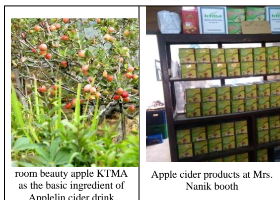
Photo 5. An overview of barter apple cider products and apple room beauty KTMA