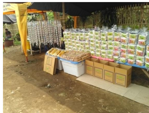
Cooperation sales of fruit chips business entrepreneurs around by KTMA

business actors and creating new business opportunities. This form is also quite effective in developing community empowerment efforts, especially in terms of building networks and increasing added value, dividing work with specialization, product innovation and creating new business opportunities.